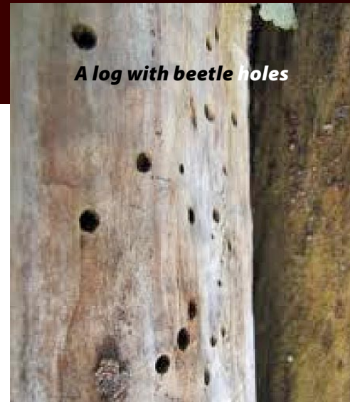
A log with beetle holes

The spiral offers homes and food to a multitude of small creatures by making maximum use of a small area (two to four metres in diameter).