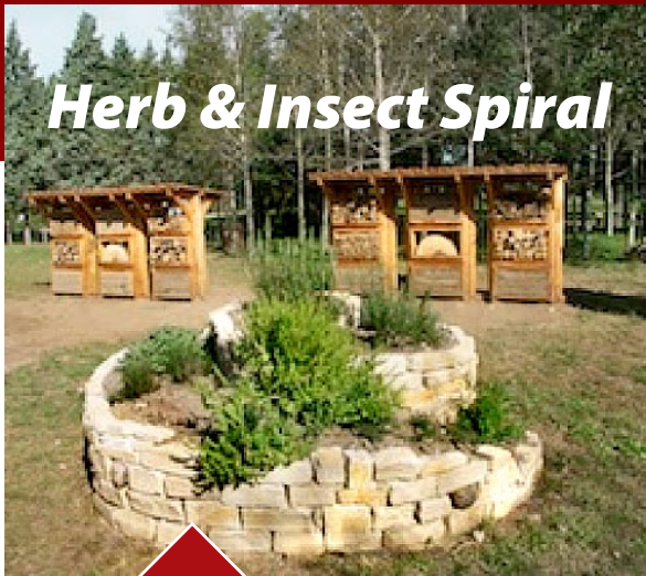
Herb and Insects Spiral from Urban Bees. Chris Fuller's Bee Village at Kin Kin. Wall faces north-east.

This wall of dry stones built in a spiral shape helps to warm and dry light soil. This structure favours the growth of Mediterranean aromatic plants and nectariferous plants that bees love. Temperature and hygrometry differ between the top and the base of the spiral.