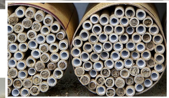
This resin bee takes a liking to the liners!