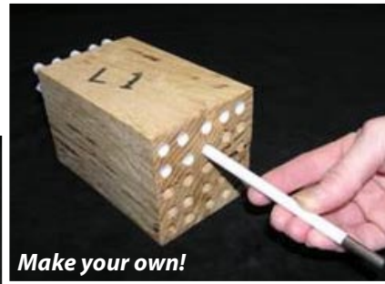
Make your own!